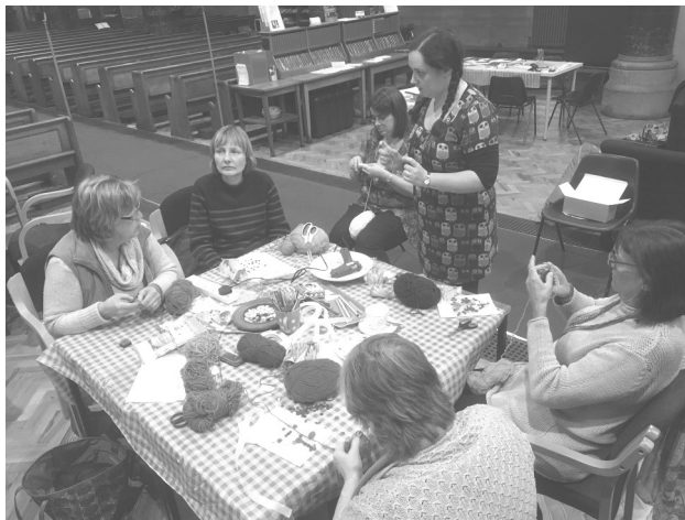
ABOVE: Crafts at St Paul's; the last session included a crochet clinic, and making paper roses for Mothering Sunday. Next one is on Saturday 17th March at 10am.

because the church is so draughty, but a contractor has come up with a suggestion which may begin to help. We'll report back in more detail once we've got him on site!